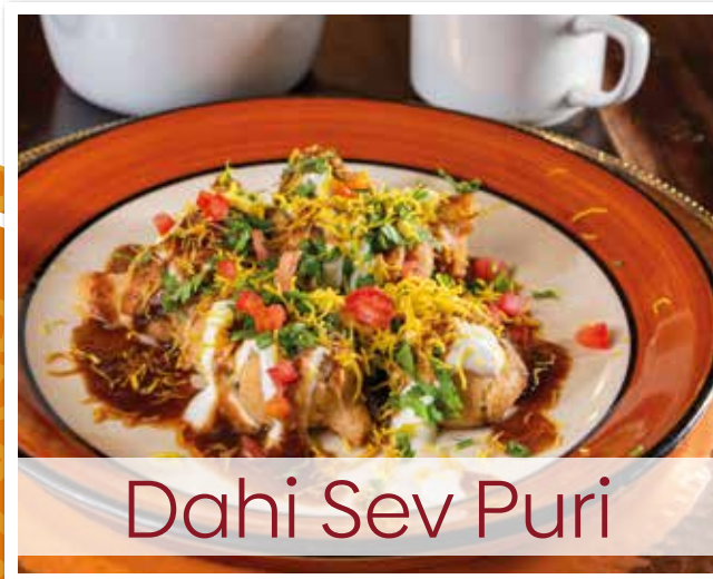
Dahi Sev Puri